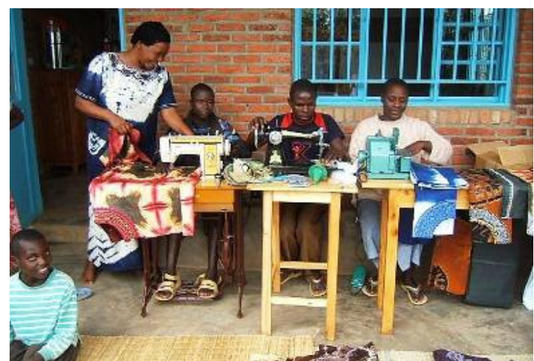
Expert Tailors design the garment under supervision