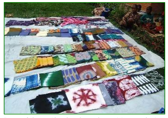
Some of the Batiks already made awaiting marketing