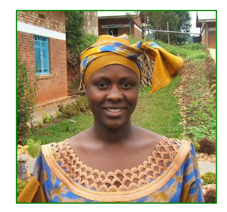
Komera Models in the making, God is our helper.